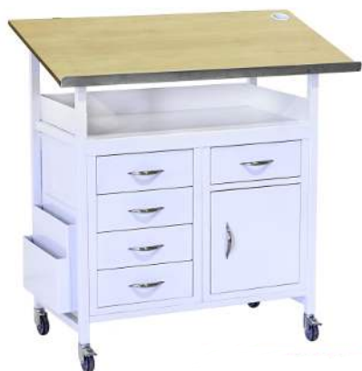
ICU Bed-End Unit With 5 Drawers And 1x Cabinet Item Code: VM-ICUBT5DW