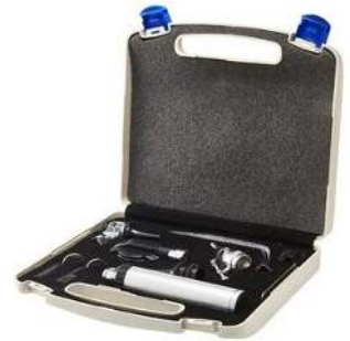
Diagnostic Set Universal LED-Blue (White Case)