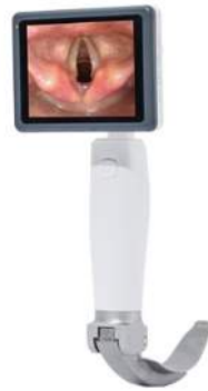
Amoul Video Laryngoscope with Reusable Blades