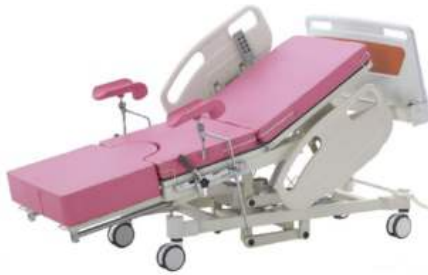
Obstetric Electric Bed