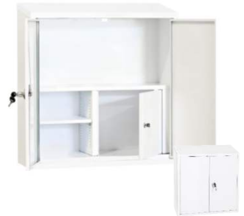
Large Double Door Sch7 Cabinet 765 x 700 x 290mm Item Code: VM-CDDDDP