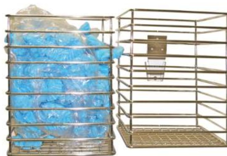
Wire SS Cap Holder Item Code: VM-WSSCP