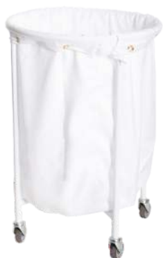
Soiled Linen Receiver Ring Type With Bag