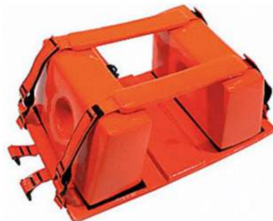
Head Immobiliser(Head Blocks)Adult