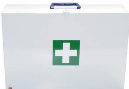
First Aid Kit Regulation 7 Metal Box