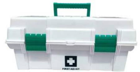
First Aid Kit Regulation 7 Plastic Box