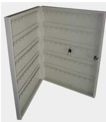
Key Cabinet 100 Keys Item Code: VM-CK100