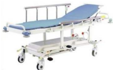
Patient Transport Hydraulic Stretcher