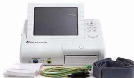
Doppler Foetal CMS800G 8.4" Item Code: VM-DF800G