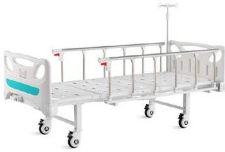
Hospital Bed Manual Two Function