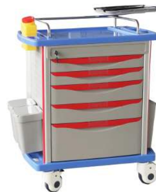
Emergency Trolley ABS With CPR Board