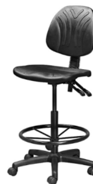
Draughtsman's Chair Industrial PU Seat