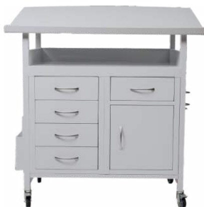
ICU Bed-End Unit With ABS Top, 5 Drawers And 1x Cabinet Item Code: VM-ICUBT5DWABS