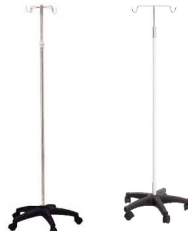
Infusion Stand Mobile 5 Legs Nylon Base