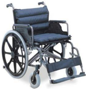
Wheelchair Steel Flip Arm Detach Foot 56cm 125kg