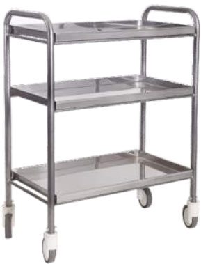
Three Tier Stainless Steel Trolley Item Code: VM-T3SS