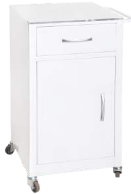
Bedside Locker Stainless Steel Top