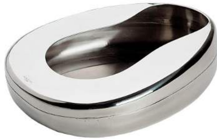
Bedpan Stainless Steel Item Code: VM-BDPSS