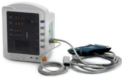
Contec Vital Signs Monitor CMS5100 SPO2 & NIBP