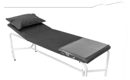
Exam Couch Fitted Sheet With Optional PVC Protector 45 x 70cm