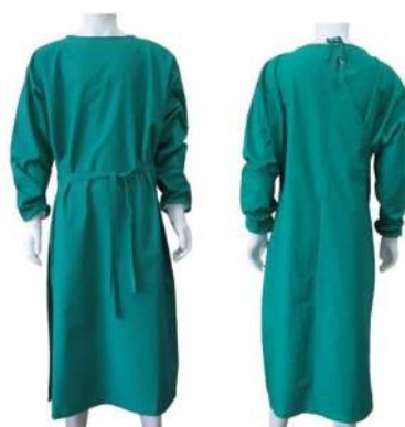
Doctor's Theatre Gowns