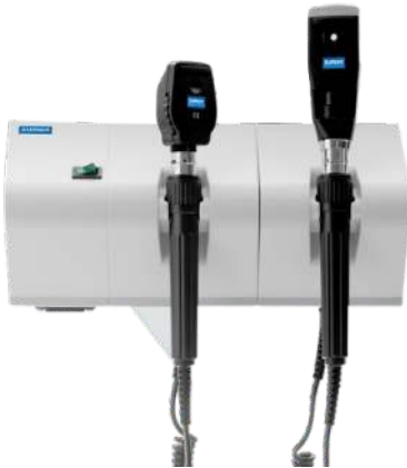
Diagnostic Set DW1010 Wall Mounted Otoscope And Ophthalmoscope