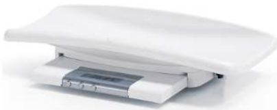
Scale MS3500 – Baby Scale Item Code: VM-SBMS3500