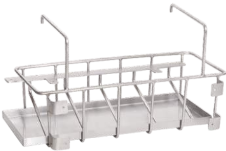
5 Bedpan and Urinal Rack With Drip Tray S/S Item Code: VM-BPU5