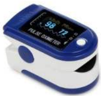
Pulse Oximeter Fingertip With LED Display