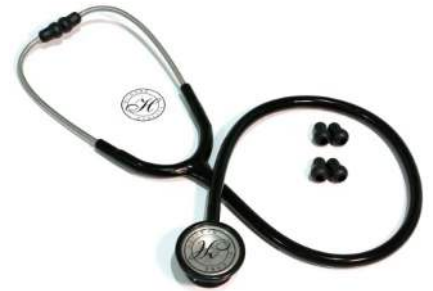
Scale Chair Digital 300kg