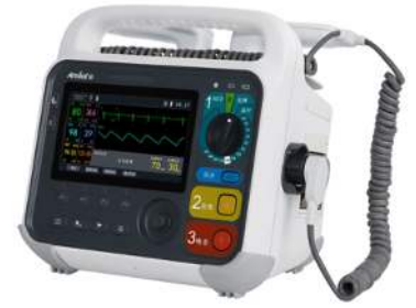
Amoul I6 Defibrillator Monitor with ECG, SPO2 and Temp