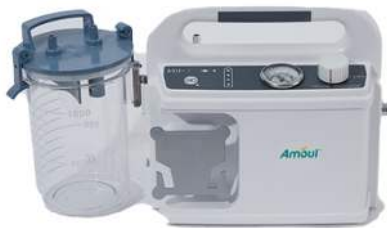
Amoul Suction Unit Electric