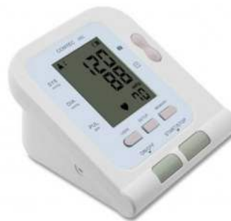
Contec CMS08C Blood Pressure Meter Digital Desktop