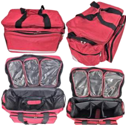
Advanced Life Support Bag With Contents