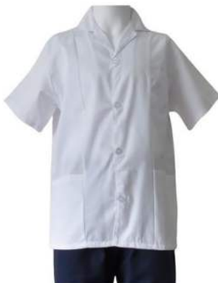
Long or Short Sleeve Dr's Jacket