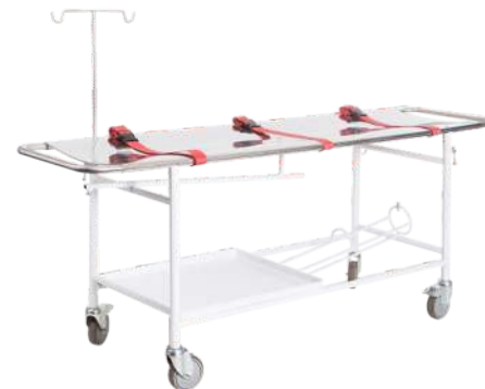
Patient Trolley With Stainless Steel Top, Drip rod and Oxygen holder