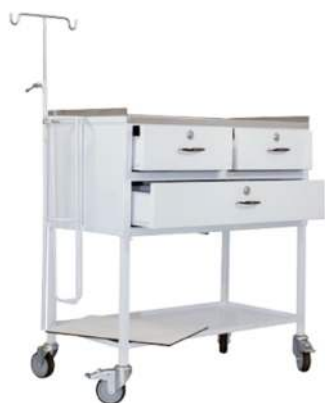
Emergency Trolley 3 Drawer Epoxy With O2 Tank cage Drip rod Mobile