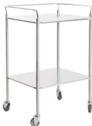
Dressing Trolley Medium Stainless Steel 610 x 458mm Item Code: VM-DTMSS