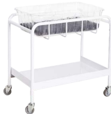
Bassinet Complete With Crib