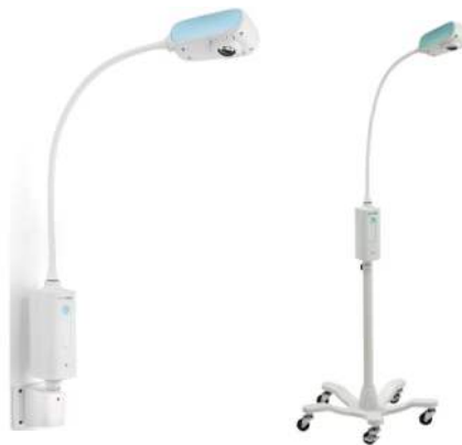
Welch Allyn GS300 Wall Mounted or Mobile Exam Light