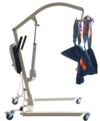
Patient Hoist Electric Mobile 150kg