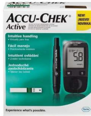
Accu-Chek Active Glucose Meter