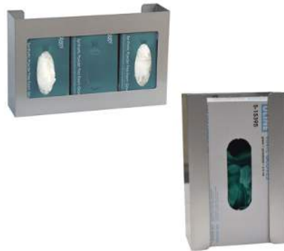
Glove Holder Aluminum Single / Double or Triple Box Item Code: VM-GHAS/D/T