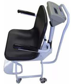
Scale Chair Digital 300kg Item Code: VM-SDC