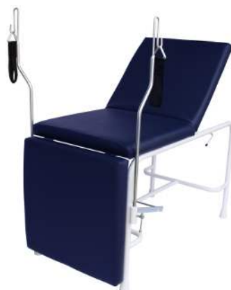
Examination Couch Gynae Type 3 Section With Lithotomy Stirrups