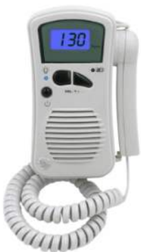
Doppler Foetal BF500++ Pocket Item Code: VM-DP500++