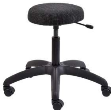
Dental Stool Height Adjustable