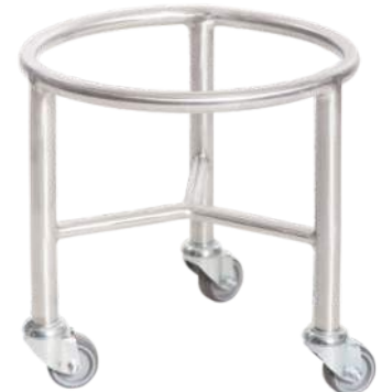
Kick About Bucket Type Stainless Steel Item Code: VM-KABU