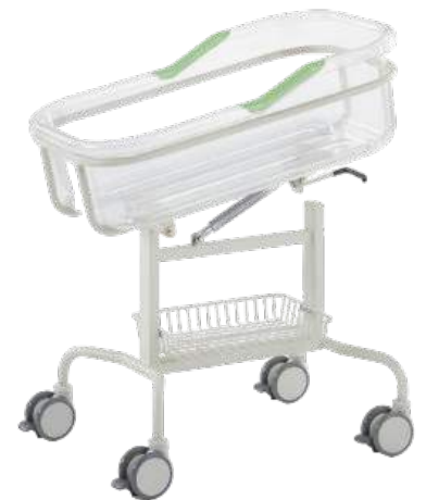
Bassinet With Crib Adjustable Trendelenburg