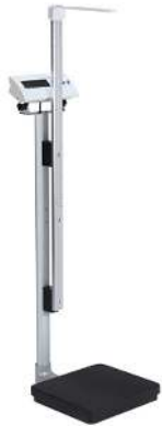
Scale MS3400 – Adult 300kg (Digital/Height Rod/BMI) Item Code: VM-SDMS3400