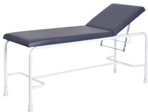
Examination Couch With Adjustable Backrest