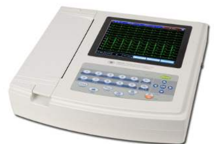
ECG 1200G - 12 Channel & Interpretation