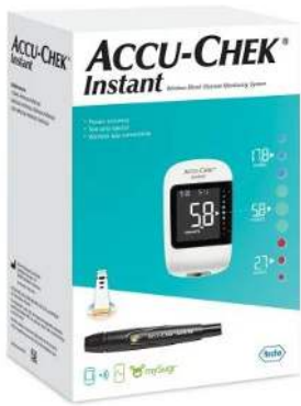
Accu-Chek Instant Glucose Meter