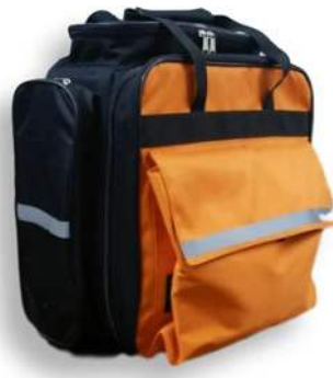
Basic Life Support Bag With Contents