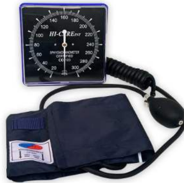
BP Meter Aneroid W/M Square Swivel