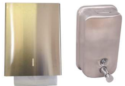
Stainless Steel Paper Towel Dispenser Soap Dispenser Manual Item Code: VM-SSPTD/SDM