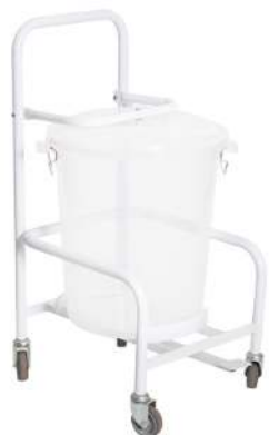
Clinibin Small 50L Mobile