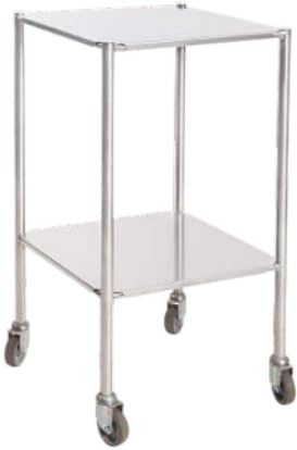
Instrument Trolley Large Stainless Steel 915 x 458mm Item Code: VM-ITLSS