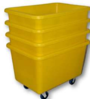
Plastic Nest Bin (Various Colours) 1050 x 749 x 585mm