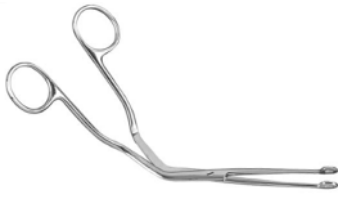
Forceps Magills Adult 24cm / Child 19cm or Infant 16cm