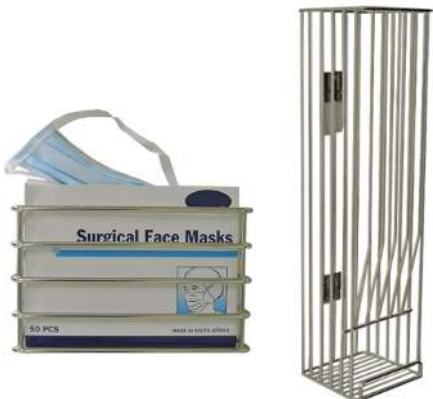
Wire SS Mask / Scrub Brush Holder Item Code: VM-WSSMH/SBH