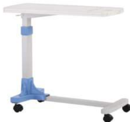
Overbed Table Height Adjustable With ABS Top