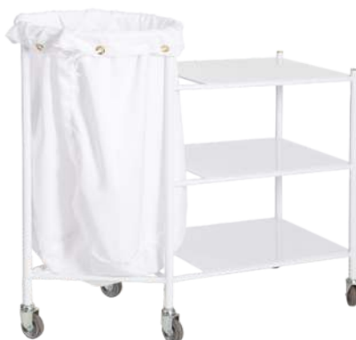
Soiled Linen Receiver With 3 Shelves and Bag