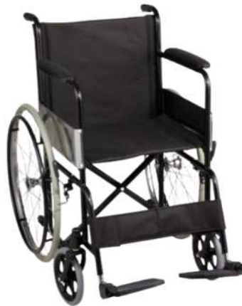
Wheelchair Basic 46cm Fixed Arm And Foot Rest