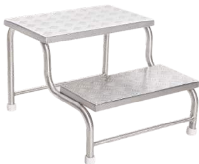
Double Step, Stainless Steel Frame With Checkered Top