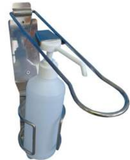
Elbow Dispenser Stainless Steel Item Code: VM-ELBDSS