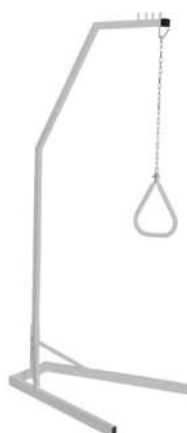
Lifting Pole (Monkey Pole) With Handle