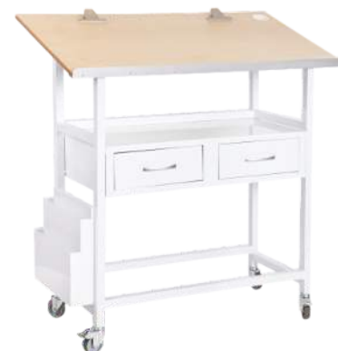
ICU Chart Trolley With 2 Drawers Item Code: VM-ICUBT2D