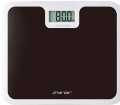
Adult Floor Weighing Scale 250kg Item Code: VM-SD7301