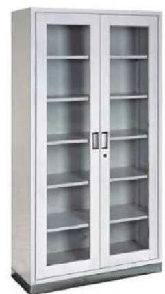
Appliance Cabinet with Double Door With 4 Shelves Item Code: VM-G19