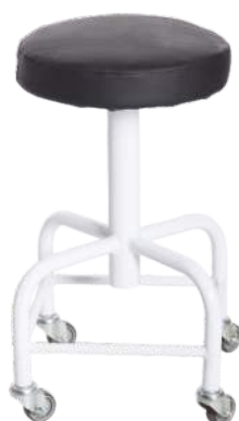
Operation Stool Height Adjustable On Castors Or Feet Epoxy