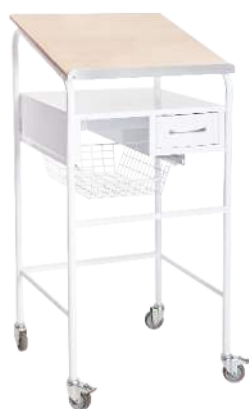
Neo-Natal Bed End Trolley Item Code: VM-NNBET