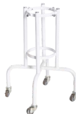
Oxygen Stand Upright Small On Castors