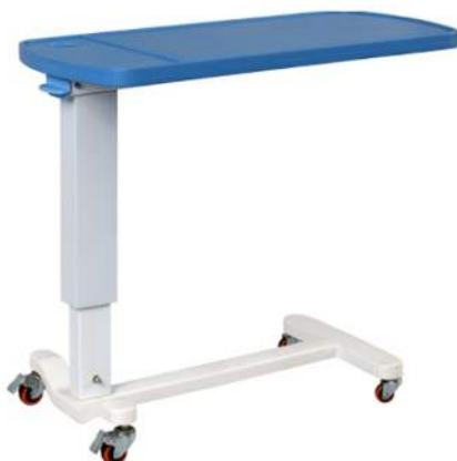
Overbed Table Height Adjustable ABS Top