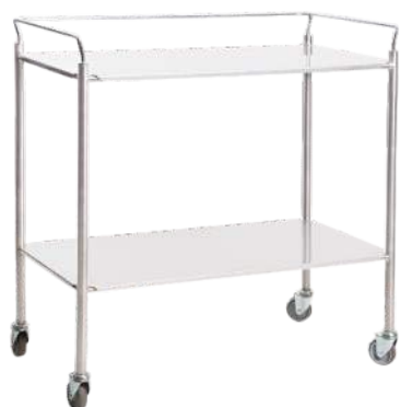
Dressing Trolley Large Stainless Steel 915 x 458mm Item Code: VM-DTLSS