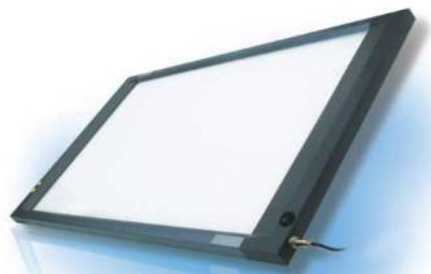
X-Ray Viewer 1 Panel Halogen