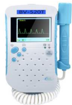
Vascular Doppler BV-520 Item Code: VM-DVBV520