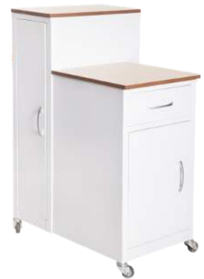
Combination Bedside Locker Short Version