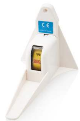
Height Measure 2m Wall Mounted