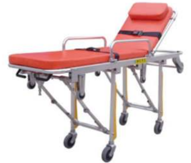
Stretcher Self Loading YSC11