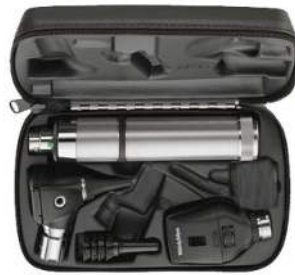
Welch Allyn 97250-BIL Diagnostic Set