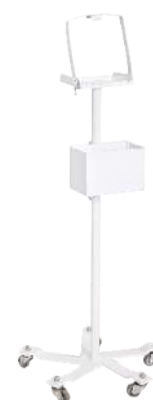
Patient Monitor Trolley