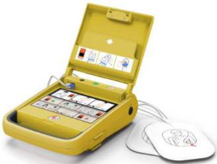
Amoul AED I3 Semi-Automatic External Defibrillator