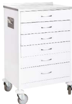
Anaesthetic Trolley 6 Drawers