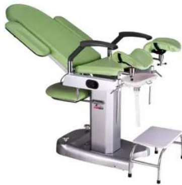
Gynae Examination Couch Electric