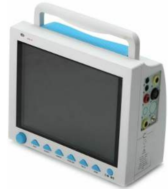
Patient Monitor CMS8000 & Nibp/Spo2/T/ECG