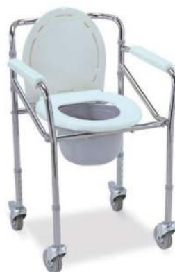
Commode - Castors Lock 100kg