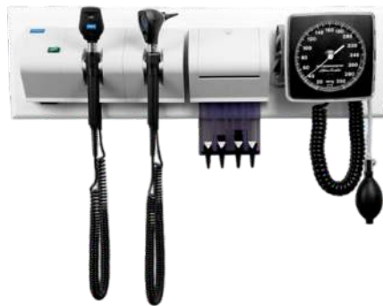
Diagnostic Set DW1060 Wall Mounted Otoscope And Ophthalmoscope