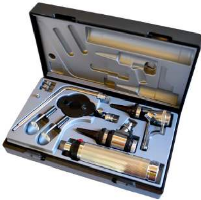
Diagnostic ENT Set