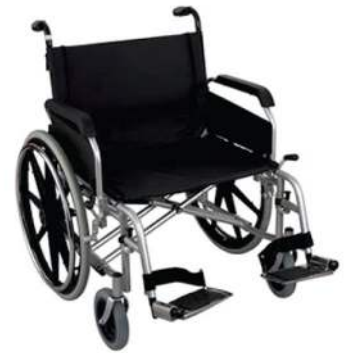
Wheelchair Jade Bariatric 26" 185kg