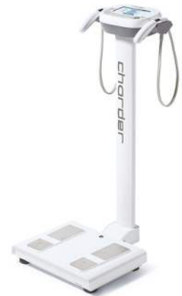
Body Composition Analyzer Item Code: WA-BCA601