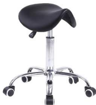
Adjustable Height Rolling Ergonomic Saddle Stool