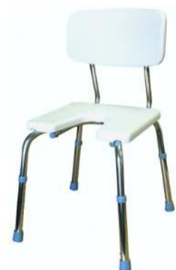
Shower Chair U-Shaped Freestanding