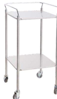
Dressing Trolley Small Stainless Steel 458 x 458mm Item Code: VM-DTSSS