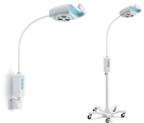
Welch Allyn GS600 Wall Mounted or Mobile Exam Light