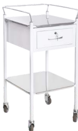
Anesthetic Trolley Single Drawer