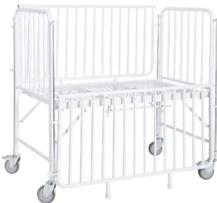
Cot Bed Child Drop-down Cotsides