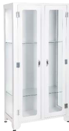
Instrument Cabinet Double Door With 5 Glass Shelves Item Code: VM-C2DA