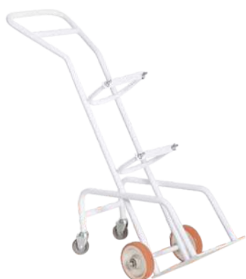
Oxygen Stand SABS Leaning Type