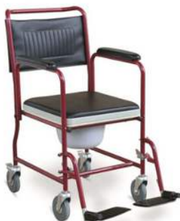
Commode Chair Steel with Detachable Armrest and Foot Rest