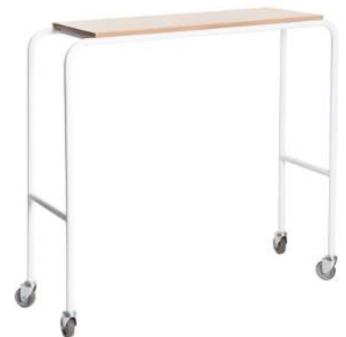
Overbed Table Fixed Height with Wood Top And Castors