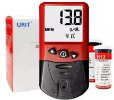
HB Meter Urit 12 + 25 Strips