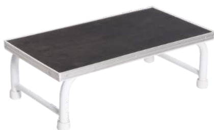
Single Step Rubber Top, Aluminium Edge