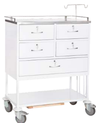
Emergency Trolley 5 Drawer Epoxy With O2 Tank cage Drip rod Mobile