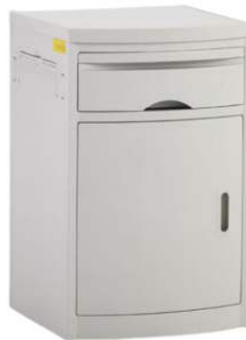
Bedside Locker Blue ABS On Castors