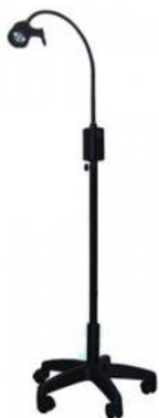
Examination Lamp Mobile Goose Neck LED