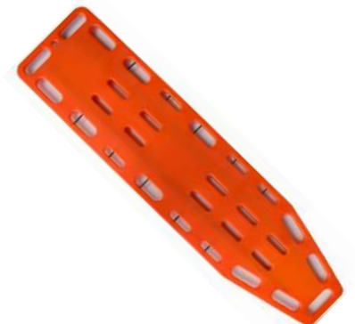
Spine Board - Plastic