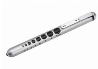
Adult Floor Weighing Scale 250kg