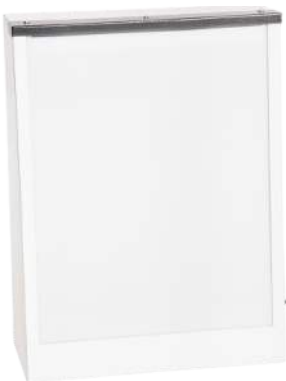
X-Ray Viewer 1 Panel Halogen