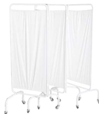
Bedscreen 3 Fold With PVC Curtains Castors Item Code: VM-BS3