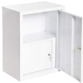
Large DDP Sch7 Cabinet 460 x 610 x 310mm Item Code: VM-CLDDP