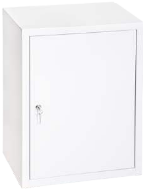
Large Drug Cabinet Lockable 460 x 610 x 305mm Item Code: VM-DCL