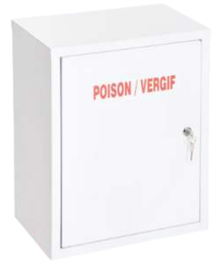
Medium Poison Cabinet 360 x 440 x 230mm Item Code: VM-DPCM