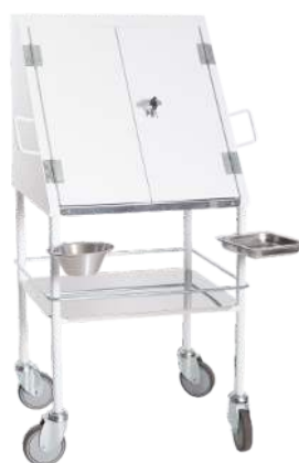
Double Door Utility Drug Cabinet Mobile Item Code: VM-UDC