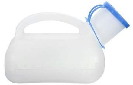
Urinal Plastic Autoclave With Lid Item Code: VM-UMPAL