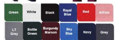
Unisex Theatre Suits