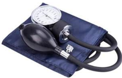
BP Meter Aneroid Single Hand