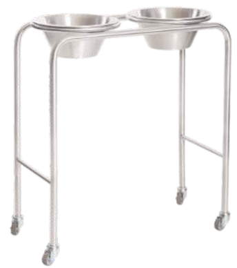
Double Bowl Stand Stainless Steel Item Code: VM-BDSS