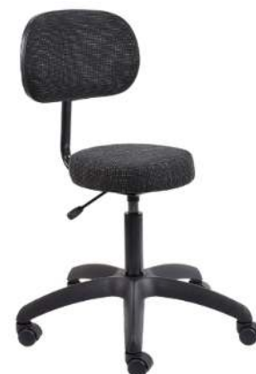
Dental Stool Height Adjustable With Backrest