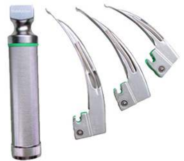
Fibre Optic Laryngoscope