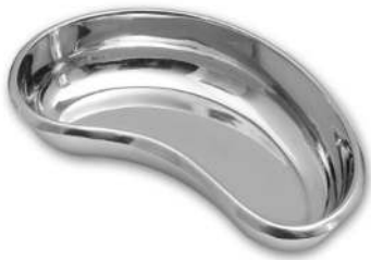
Kidney Dish Stainless Steel 15 / 20 / 25 / 30cm Item Code: VM-KIDSS15