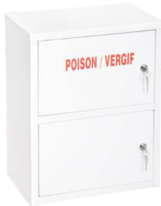
One on Top of Another Poison Cabinet 360 x 440 x 230mm Item Code: VM-CD1TAP