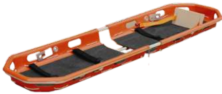
Basket Stretcher Plastic