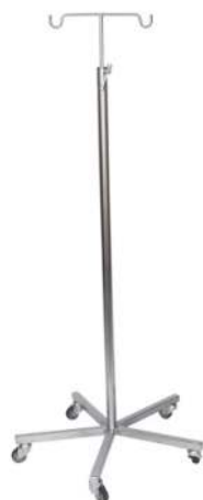
Drip Stand 5 Leg Base Stainless Steel