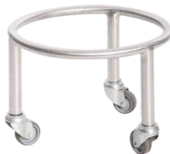
Kick About Bowl Type Stainless Steel Item Code: VM-KABBU