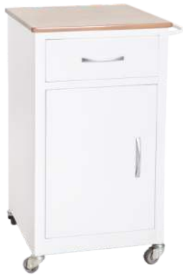
Bedside Locker Wood Top