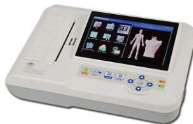
ECG 600G - 3 / 6 Channel & Interpretation