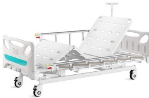
Hospital Bed Manual Three Function