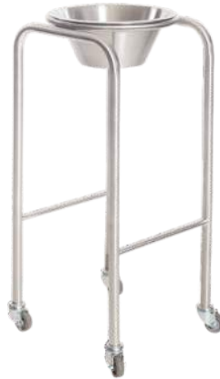
Single Bowl Stand Stainless Steel Item Code: VM-BSSS