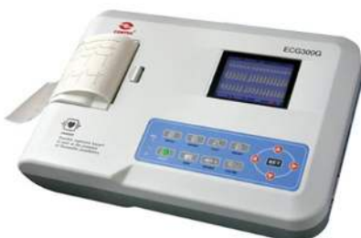
ECG 300G - 3 Channel & Interpretation