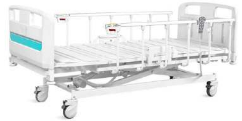
Hospital Bed Electric Three Function