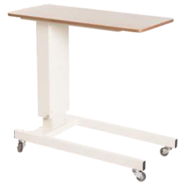
Overbed Table With Hydraulic Height Adjustment And Oak Top