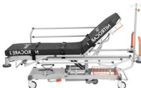
Nitrocare Patient Transport Stretcher