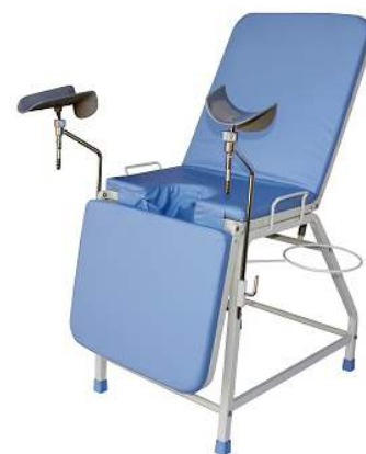
Examination Chair, 3 Section Obstetric And Gynae Use (Available in Blue/Pink)