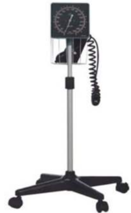
BP Meter Aneroid Mobile (Teles Stand)