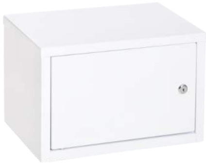
Extra Small Poison Cabinet 360 x 240 x 230mm Item Code: VM-DCXS