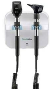
Welch Allyn 77747-L Wall Mounted Diagnostic Set