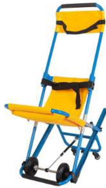
Chair For Stair Evacuation