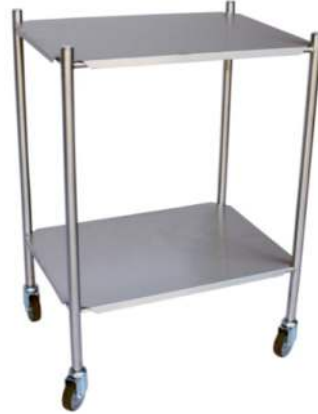
Instrument Trolley Medium Stainless Steel 610 x 458mm Item Code: VM-ITMSS