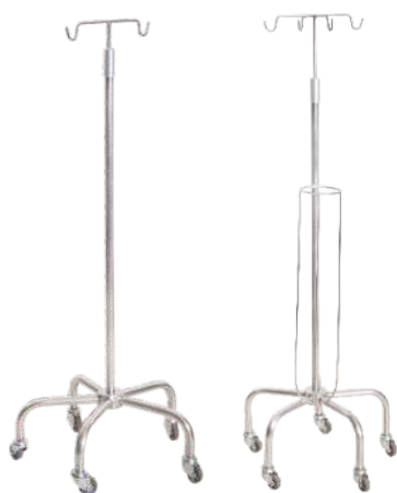
Drip Stand 5 Leg Stainless Steel Heavy Duty(Optional O2 Tank Holder)