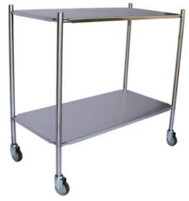
Instrument Trolley Small Stainless Steel 458 x 458mm Item Code: VM-ITSSS