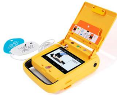
Amoul AED I5 Semi-Automatic External Defibrillator