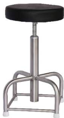
Operation Stool Height Adjustable On Castors Or Feet S/S