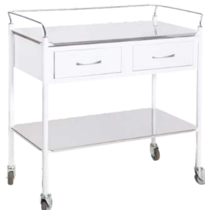
Anesthetic Trolley Double Drawer