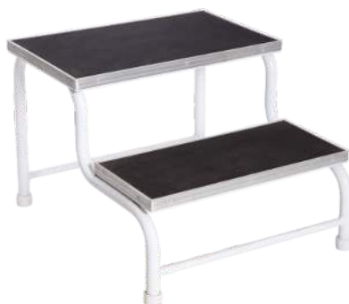
Double Step Rubber Top, Aluminium Edge