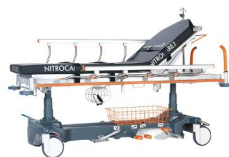
Nitrocare Patient Emergency Stretcher SD05