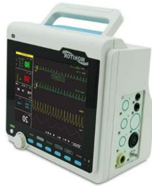
Patient Monitor CMS6000 & Nibp/Spo2/Tem/ECG