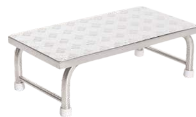
Single Step, Stainless Steel Frame With Checkered Top