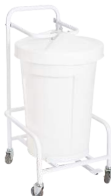
Clinibin Large 85L Mobile