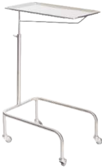
Mayo Table Stainless Steel With Tray Item Code: VM-MTOSS