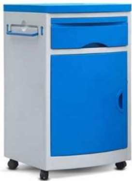
Bedside Locker ABS On Castors