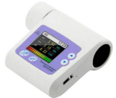
Spirometer SP10 Digital, USB