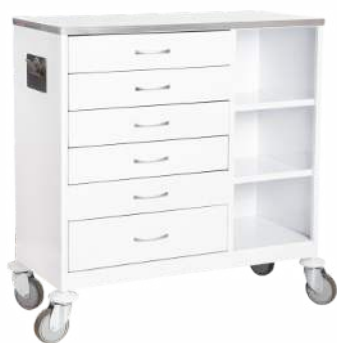
Anaesthetic Trolley 6 Drawers With 3 Shelves